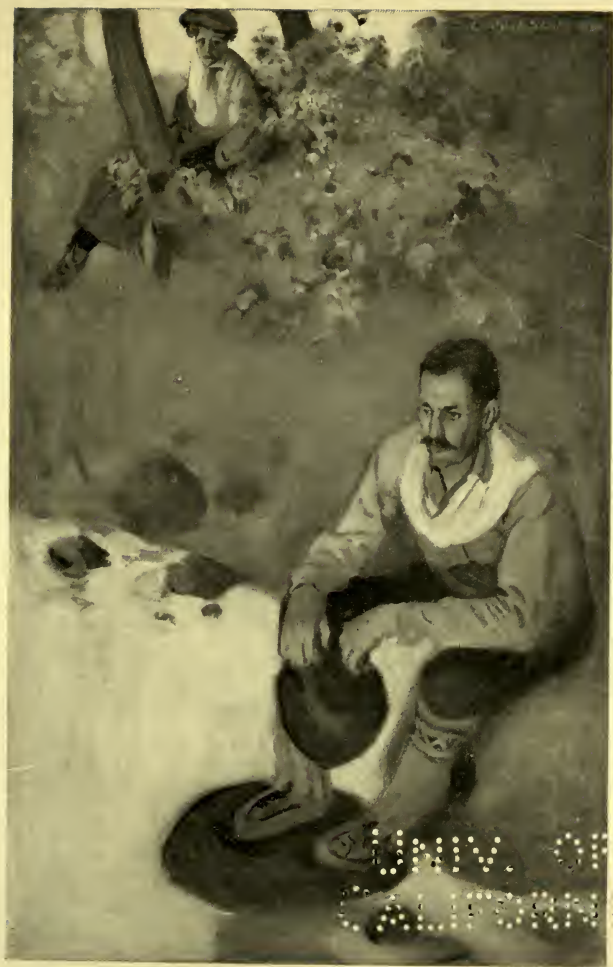
Virginia gasped at the change in him.